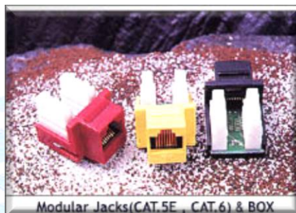
Modular Jacks(CAT.5E , CAT.6) & BOX